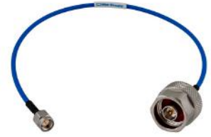
CASE STYLE: SE2635-24

Connectors SMA-Male - N-Male Model FL086-24SMNM+