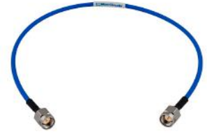
CASE STYLE: SE2634-6